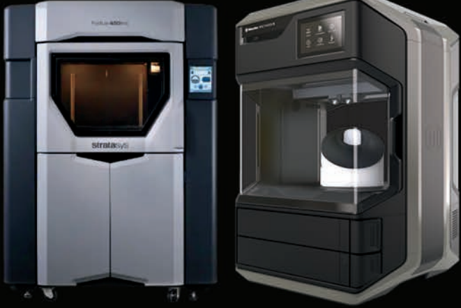
Fortus 450mc / Makerbot Method X Carbon Fiber Edition