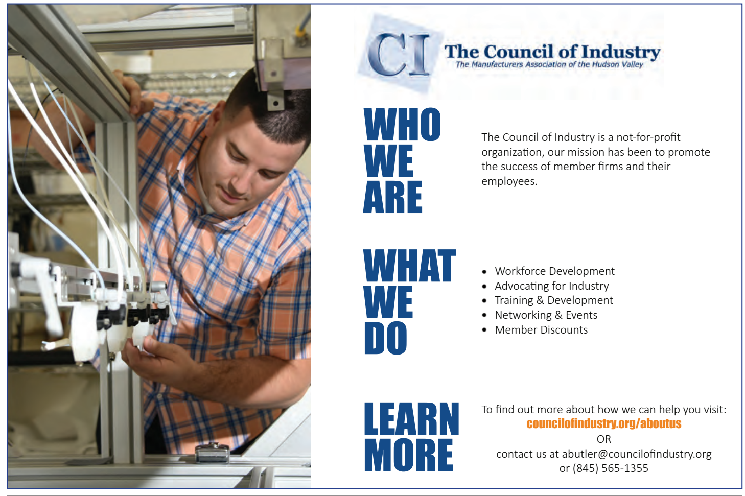
The Council of Industry Magazine and Membership Directory

Distributor of janitorial and maintenance supplies.