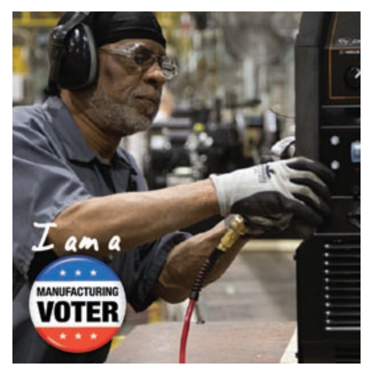
These days, in every election, there's too much at stake for manufacturers to sit on the sidelines.